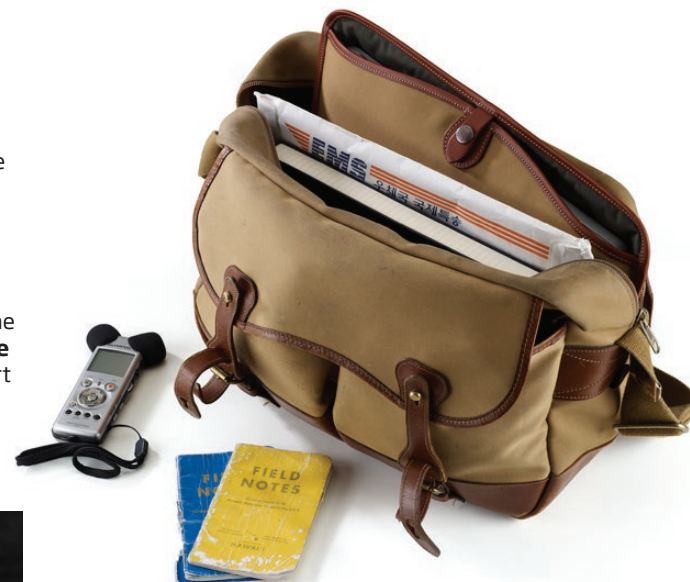
Above This original, owned by Mr Billingham, dates from 1997 and is still in daily use.

Twin zips add security and to complete the picture, the Eventer also has a full width zippered back pocket 4 - convenient and accessible storage for passports, tickets, maps and documents.