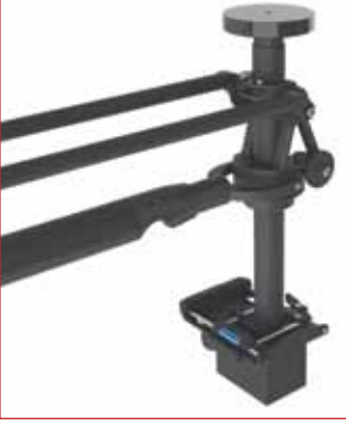
The Slave Sled, capable of operating a 6lb camera payload