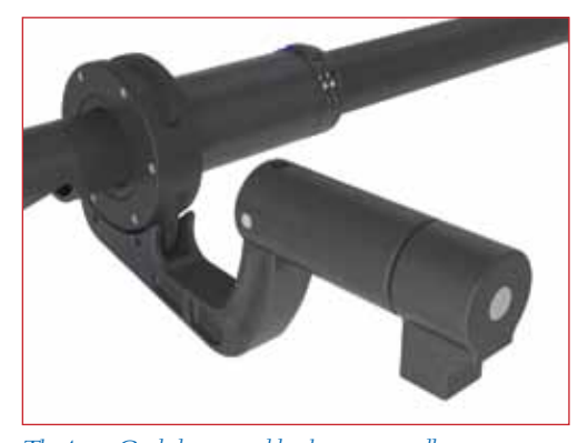
The Active Gimbal, supported by the arm post, allows intuitive and rapid control of elevation and transverse.

TANGO is a game-changing Steadicam accessory for use with today's miniature HD cameras according to Steve Tiffen, President and CEO of The Tiffen Company. "TANGO is designed to be a straightforward, bolt-on addition for future Tango-compatible Steadicam models."