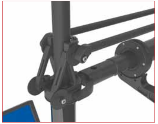
The Pulley Trees and Tie rods effortlessly transmit motion from the Master to the Slave Sled.

The Steadicam TANGO balances and feels like a single sled carrying all components. It provides a comfortable, centered operating position, even at full up/down boom. It incorporates rugged, allmechanical construction and uses a conventional Steadicam sled plus the six pound Tiffen Tango extension. "There are no electronics,